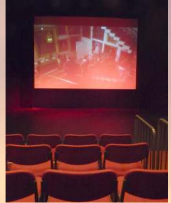
The 5mtr x 4mtr screen

The Coach House has a modern high definition projector and can reproduce full surround sound from multi-tracked films.