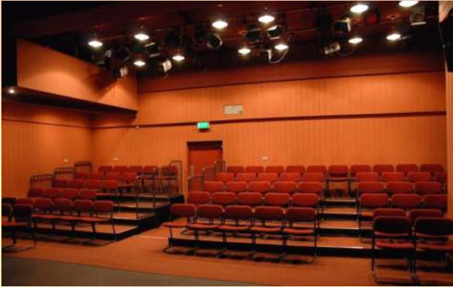
The tiered auditorium